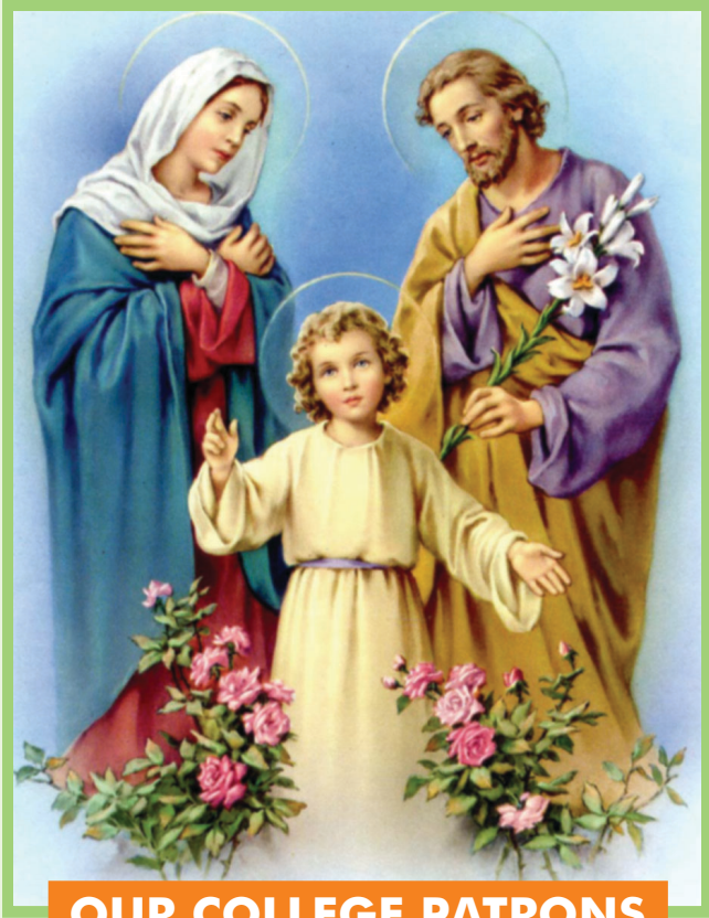
OUR COLLEGE PATRONS